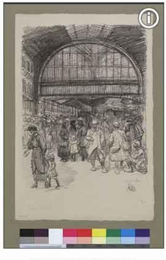
Hall of a station during wartime